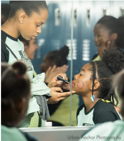
Urban Anchor Photography