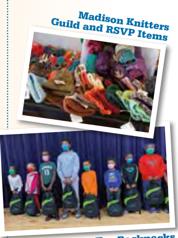
First Tee Backpacks

• Focus on Energy LED Bulbs for distribution